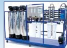
Packaged water production systems