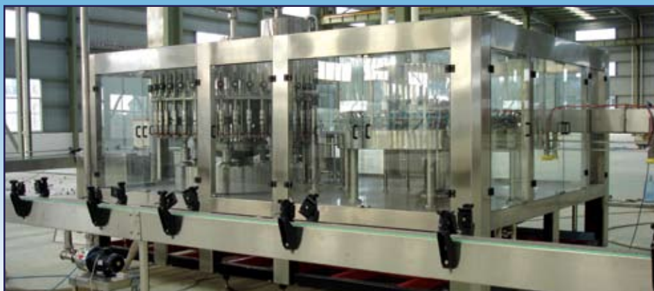
Automated bottling systems for 250 ml - 2 litre, PET or glass bottles up to 20,000 BPH

Your single source for water bottling plants and related equipment!