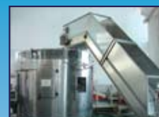
PET Bottle descramblers