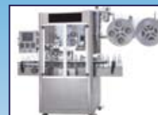
High speed sleeve labellers