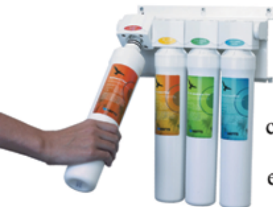
Watts® Drinking Water Units with Kwik-Change™ Cartridges

We stock everything from A to Z including components, replacement cartridges and spare parts. Virtually everything you and your customers might need.