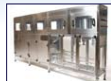
Automated 5 gal lines

MoBetta Water Inc. - Westlock, AB, Canada • Ph: 780-349-2503 • Fax: 780-349-6604 • www.mobettawater.com