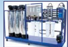
Packaged water production systems