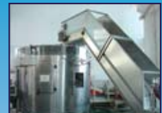
PET Bottle descramblers