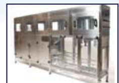
Automated 5 gal lines

MoBetta Water Inc. - Westlock, AB, Canada • Ph: 780-349-2503 • Fax: 780-349-6604 • www.mobettawater.com