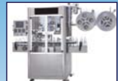
High speed sleeve labellers