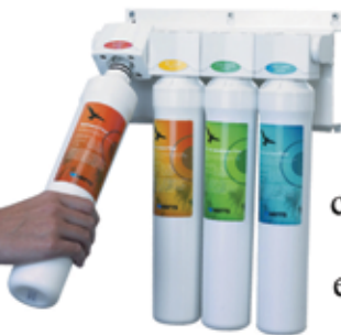
Watts® Drinking Water Units with Kwik-Change™ Cartridges

WATTS INDUSTRIES (CANADA) INC. 5435 North Service Road / Burlington, ON L7L 5H7